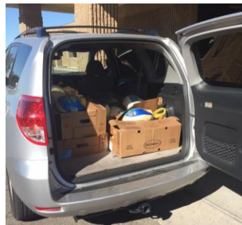
Additional photos may be found in the Photo Gallery: greenvalleymoaa.org/photos-events .