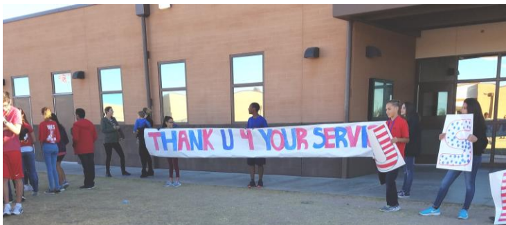
Nov. 9 – The Continental School's ceremony at the school's flagpole.