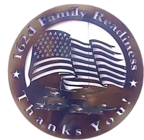
The plaque given to GVMOAA at the Turkeys for Troops presentation to the 162 nd AZANG on 16 Nov 2017.