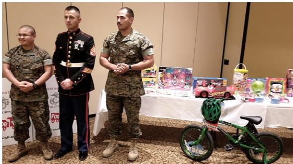
Marines from the Marine Corps Reserve Center in Tucson with some of the toys donated by members.

It was also Toys for Tots night when many of the members brought Christmas gifts for disadvantaged youth in the area. Included in these gifts were a bicycle, dolls, trucks, action toys. In addition, $205 was donated for the Marines to purchase necessary items for the children. The three Marines from the Marine Corps Reserve in Tucson were delighted with the generosity of the group when they came to pick up the donations. Thanks to all who supported this effort.